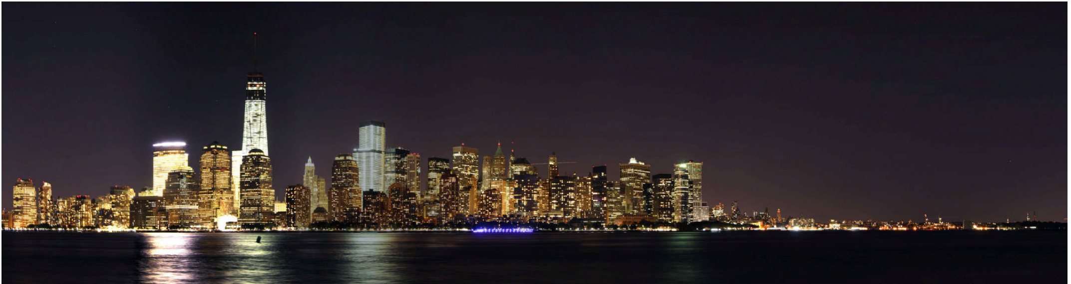
(Above and below) Panoramic views of the New York skyline.