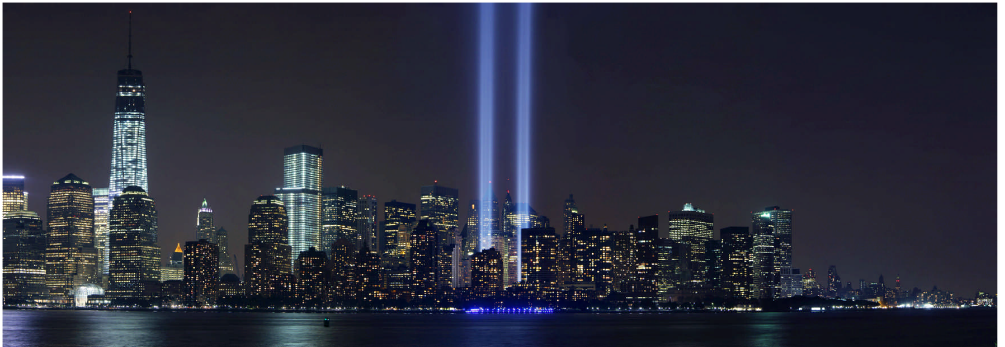
(Above) Elevated view of New York skyline. (Below) The 9/11 memorial beams of light.