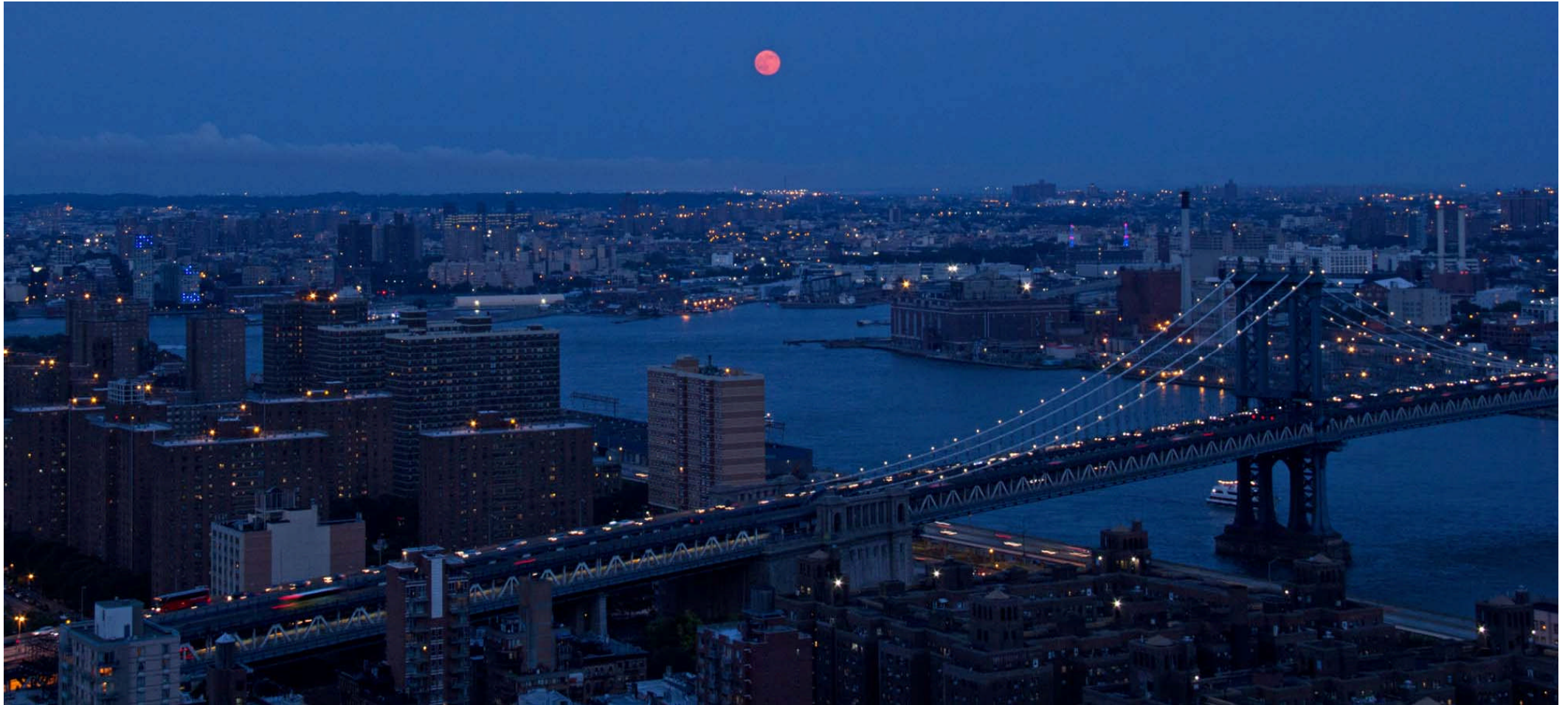
(Above) Super Moon rising above New York skyline, July 2014.