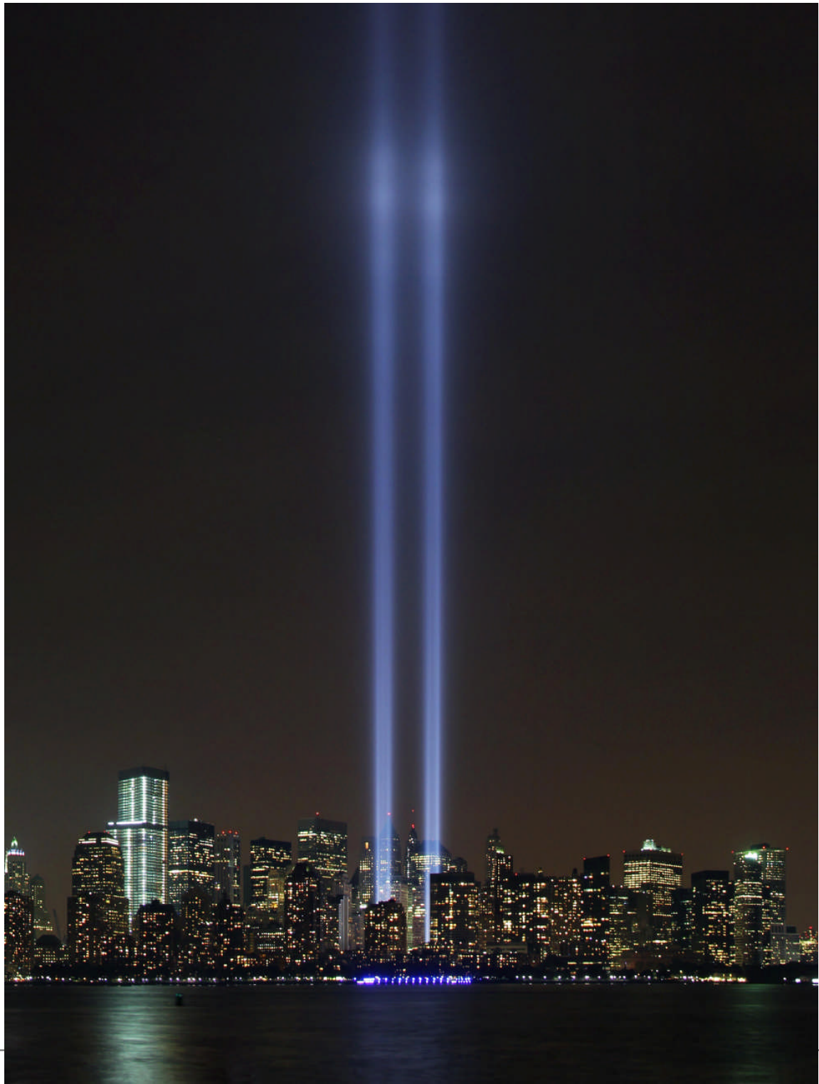
(Right) Beams of light from the 9/11 memorial.