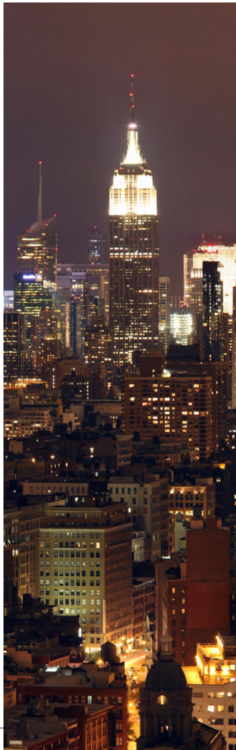
(Left) Vertical panoramic of New York by night. (Rear cover) New York at night.